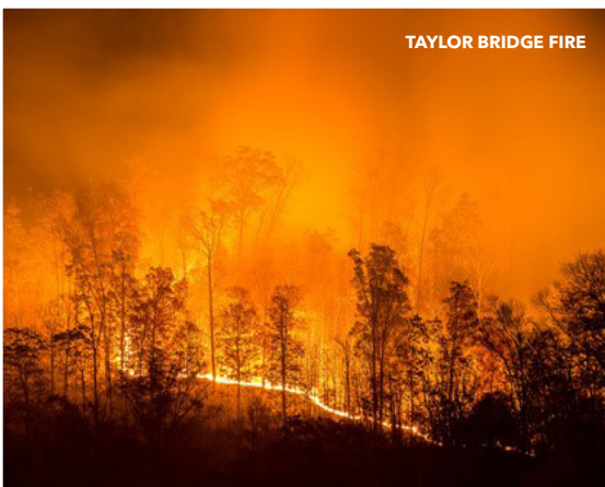
TAYLOR BRIDGE FIRE