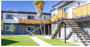
935 WEST SWAIN ROAD Stockton, CA 60 Units | $7,025,000