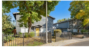
BLUE RIDGE APARTMENTS Stockton, CA 52 Units | $6,500,000