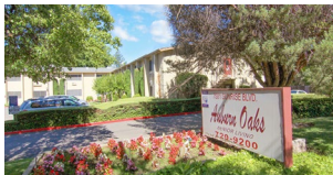
AUBURN OAKS APARTMENTS Sacramento, CA 129 Units | $6,750,000