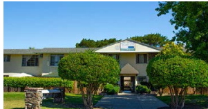
SUMMERWOOD APARTMENTS Stockton, CA 52 Units | $6,500,000