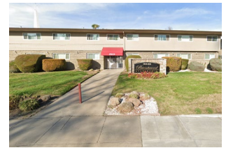
BRENTWOOD APARTMENTS Sacramento, CA 95821 52 Units | $9,488,500