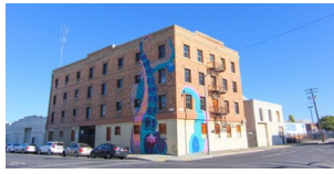
34 SOUTH AURORA STREET Stockton, CA 31 Units | $1,360,000