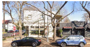
1101 & 1103 T STREET Sacramento, CA 7 Units | $1,650,000