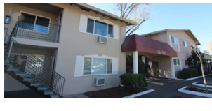
ARDEN PARK Sacramento, CA 48 Units | $7,090,000