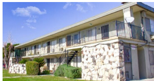
5412 HOLIDAY DRIVE Stockton, CA 18 Units | $1,700,000