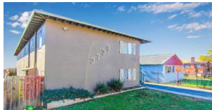
3738 4TH AVENUE Sacramento, CA 8 Units | $1,525,000