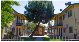
332-336 R STREET Merced, CA 8 Units | $790,000