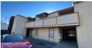
PARK VILLA APARTMENTS Stockton, CA 25 Units | $2,088,000