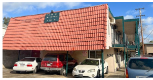
630 N VAN BUREN STREET Stockton, CA 12 Units | $1,500,000