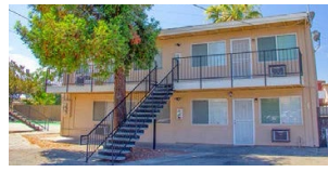
4452 COTTON COURT Stockton, CA 12 Units | $1,500,000