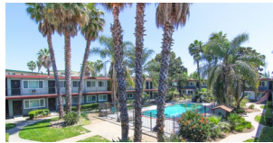
ARCADIA APARTMENTS Sacramento, CA 56 Units | $6,350,000