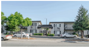
APARTMENT LANE Arcade, CA 60 Units | $8,260,000